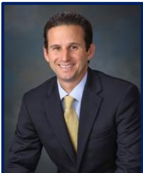
Sen. Brian Schatz (D-HI)

Expands access to telehealth services by amending title XVIII of the Social Security Act