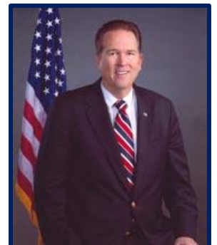
Rep. Vern Buchanan (R-FL)