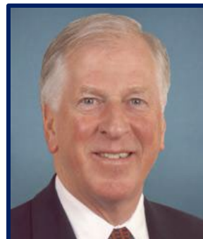
Rep. Mike Thompson (D-CA)